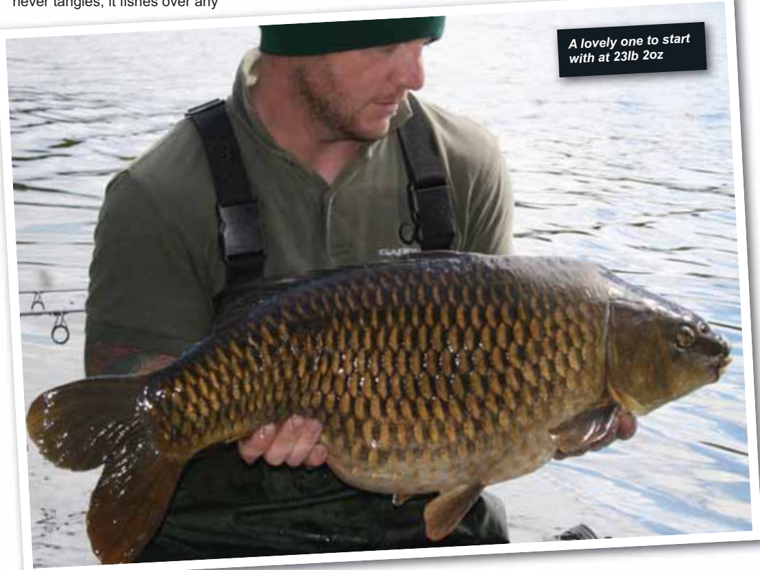
A lovely one to start with at 23lb 2oz

Walk the lake, look for signs and likely areas. You may get lucky and see a few, but without doubt the best time to visit the lake is first light. Carp can be found during the day, but when fish are found at first light this will likely be a feeding area, which will almost definitely be different to the daytime comfort zones. Once in a swim it's a case of watching the water. While fishing, setting an alarm for 2-3am, having a brew and a listen for a while is also a good way to find the fish, as they often show at night. If you're not too far from home a little baiting up is advisable. I hate moving as much as anyone but if a move is required then just grit your teeth and do it. I would rather work