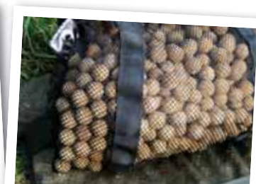
Plenty of bait, but go easy to start with