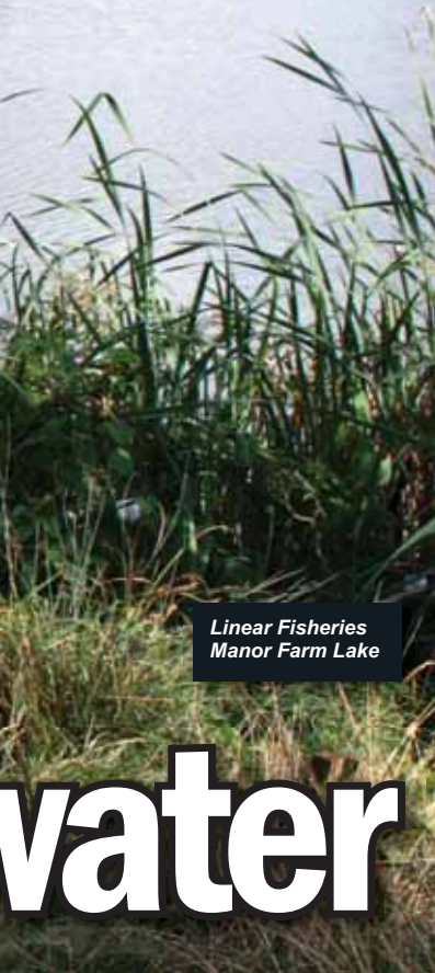
Linear Fisheries Manor Farm Lake