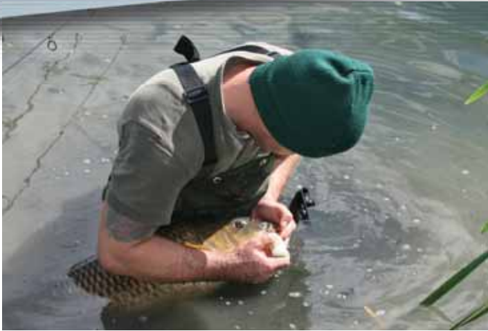
Look after your fish

to the left which is in front of a no-fishing zone. It looked great with the wind pushing in and a real likely looking area, although nothing showed while I was looking.