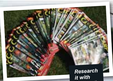
Research it with Carp-Talk