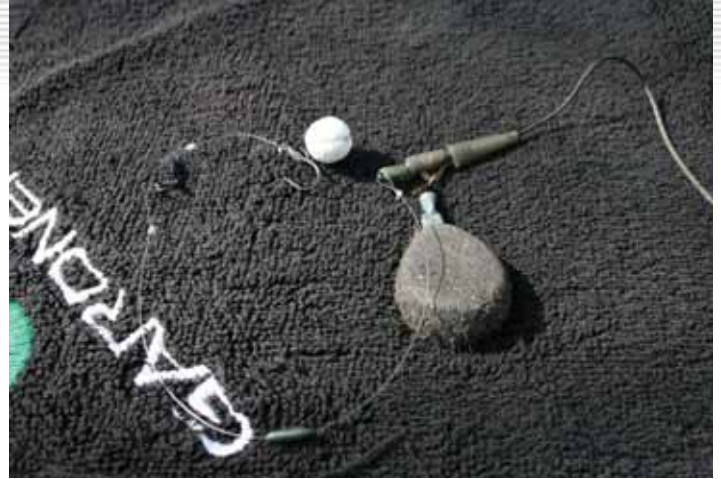
All three rods were changed to the stiff hinge rig

4, then his friend Aaron Savin set up in swim 2. These lads know Linear very well and were a good source of information to me; not only for the current session but for future trips, too. They were both very interested in my type of angling and I was more than happy to show them how I go about my business. What I did glean from them was a solid PVA bag masterclass because these two really are masters at it. Jake was long-range fishing and Aaron casting short range to a far margin. It was good to see youngsters with such good angling ability – certainly better than I had at their age! I had a real good laugh with them and