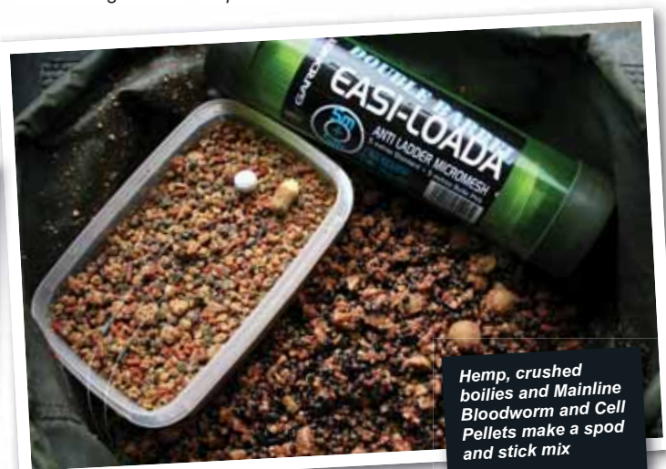
Hemp, crushed boilies and Mainline Bloodworm and Cell Pellets make a spod and stick mix